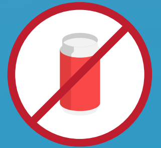
Fixatives and Preservatives