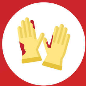
Visibly Bloody Gloves