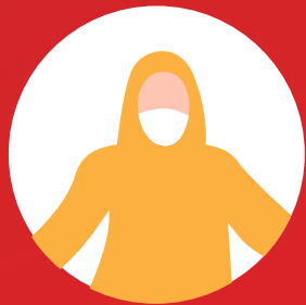
Visibly Contaminated PPE