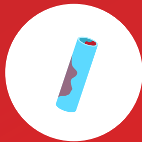
Visibly Bloody Plastic Tubing