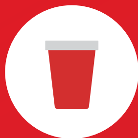
Closed Sharps Disposable Containers