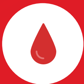
Blood & Body Fluids