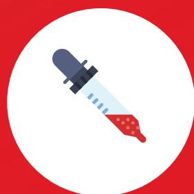
Blood Saturated Items